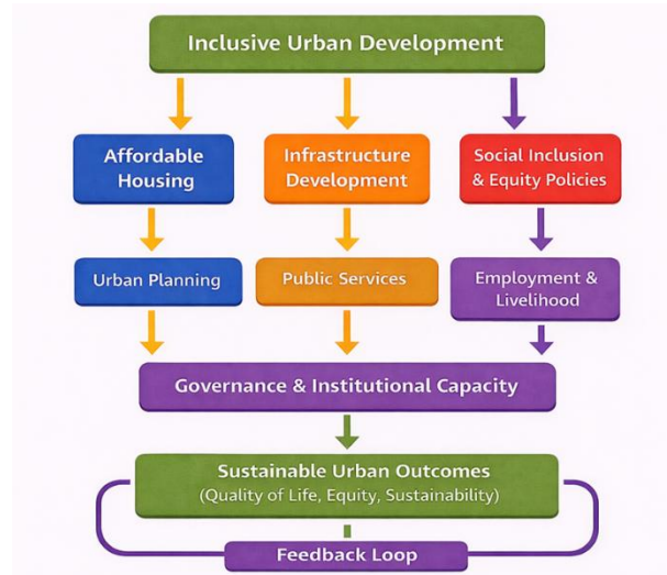
Figure 2: Policy Framework for Inclusive Urban Development in Rapidly Growing Cities

Another important factor is the need for integrated policy approaches . Addressing urban inequality requires coordination across sectors, including housing, employment, infrastructure, and social services.